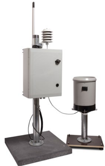
Sample Illustration: iBOX-EU with TB4, external antenna and air temperature sensor